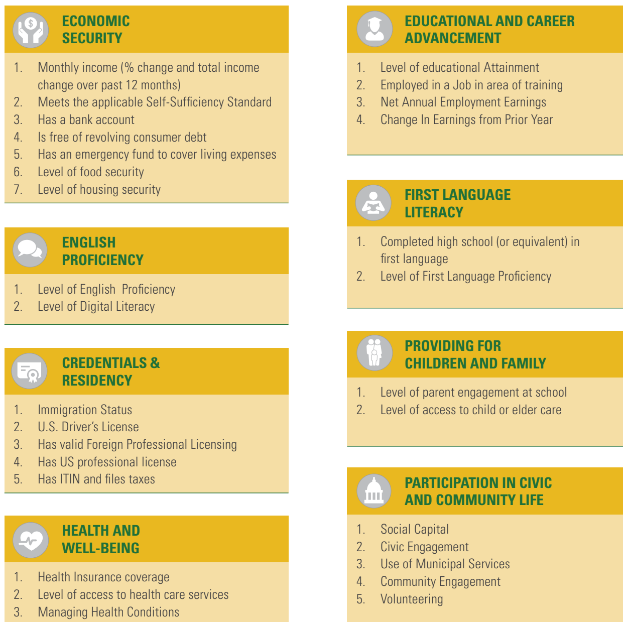
Figure 1: Eight Goal Areas and Metrics

A strong framework of support for a two-way integration process—to the mutual benefit of both immigrants and the receiving community—is essential to maintain social, cultural and economic vitality.